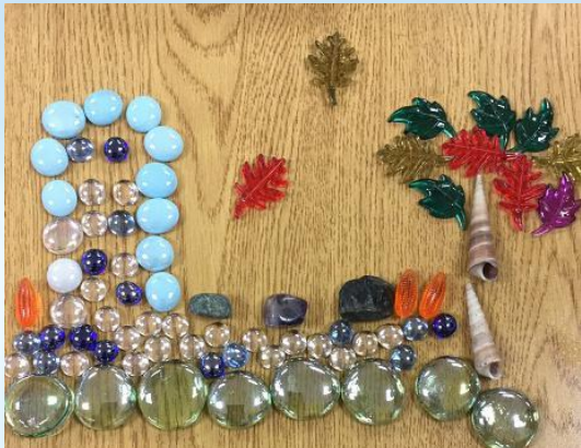
A child makes a transient art masterpiece; this is positioning