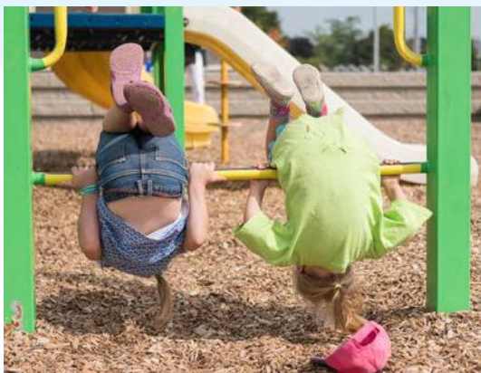
Children hang upside down at a playground; this is orientation