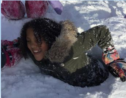
A child digs a hole in the snow and sits in it; this is enclosing

Mother Nature and other elements provide an environment that becomes the teacher. Think of learning through the lens of schemas.