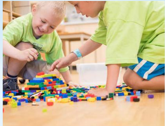
Children build a structure with Lego®; this is connection