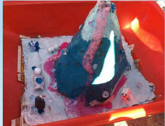
A group mixes vinegar and baking soda to make an eruption; this is transformation