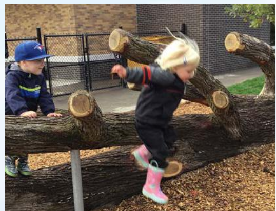
A child jumps from a log; this is trajectory