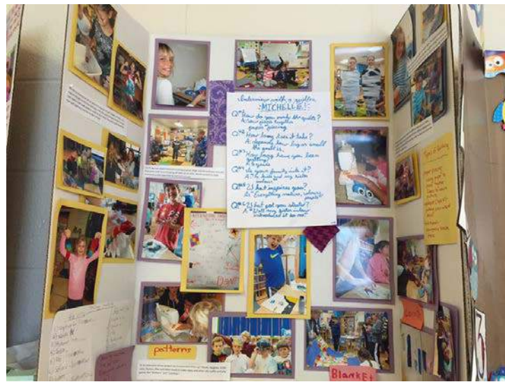
Both left and right pictures- Our display boards that were up for the "Quilting Bee".